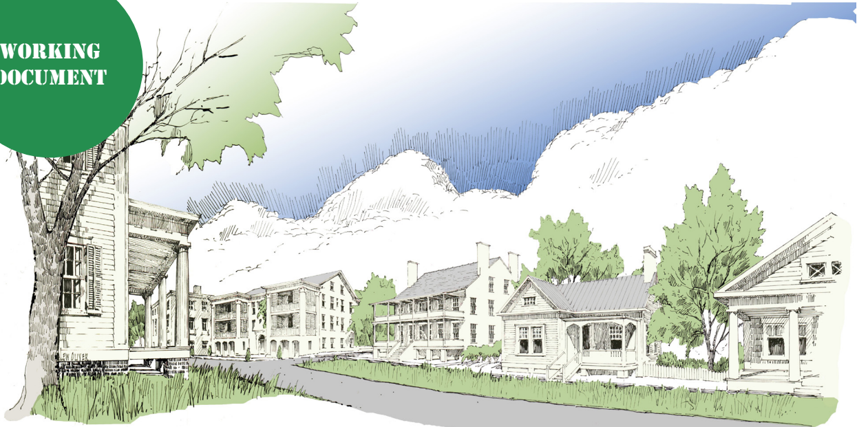
Illustration by DPZ Partners

A publication of Grantmakers In Aging A product of the Community AGEnda initiative, funded by The Pfizer Foundation