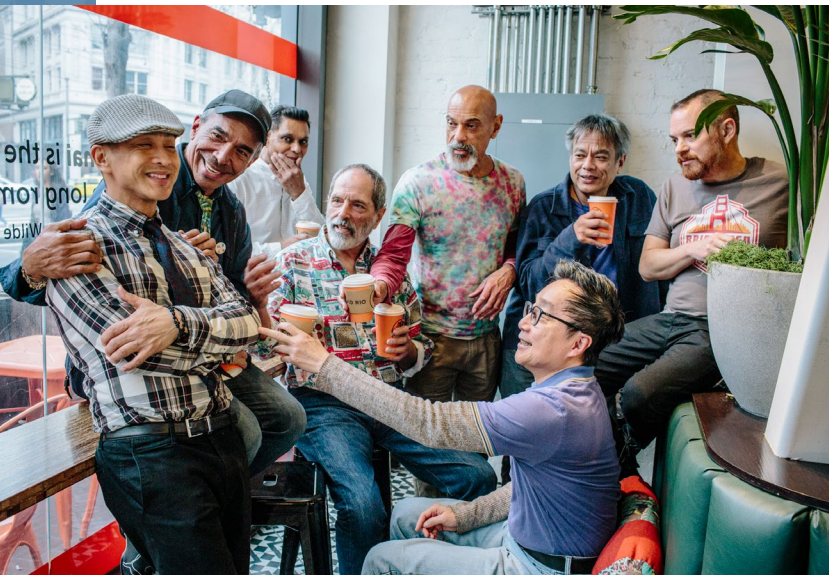
Members of the Elizabeth Taylor 50+ Network, based at the San Francisco AIDS Foundation, have a regular meeting at a local coffee shop.

To a meaningful degree, HIV/AIDS is becoming an older person's condition. The iconic red AIDS awareness ribbon is symbolically lengthening and taking on a touch of gray, and many older people living with HIV say they are not just surviving but thriving.