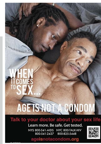
Examples of ACRIA's "Age is Not a Condom" campaign, 2016 and 2014.